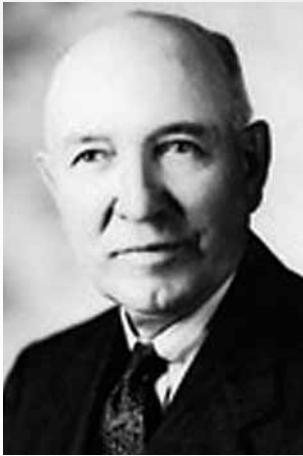
Céline Antoine Melanson (1885–1957), was the second president of the New Brunswick Federation of Labour, 1919–1921.